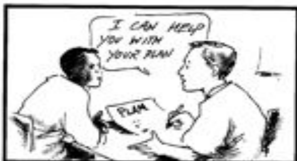
Getting the help you need