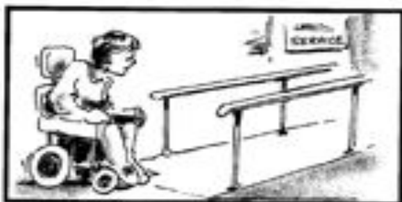
Getting a service when you need it