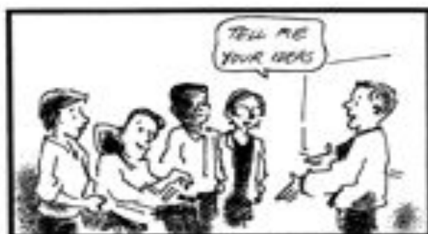
Having your say