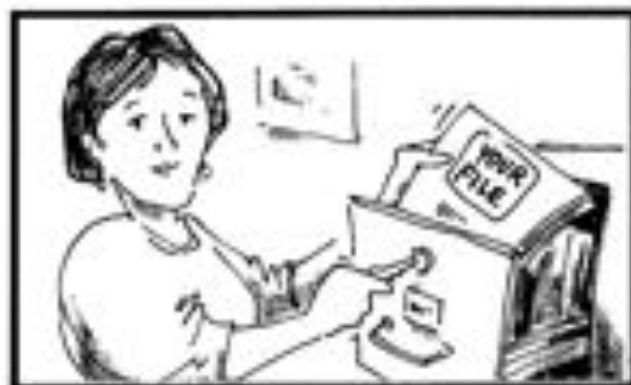
Keeping things private